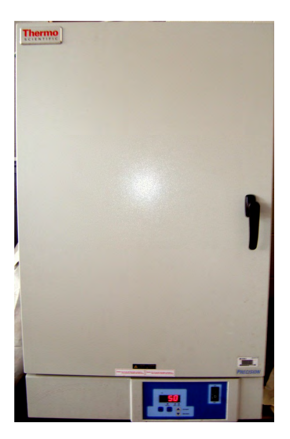
Figure 2: Oven set to 50 to 60 degrees C for drying out the collected sample placed in Pyrex dishes