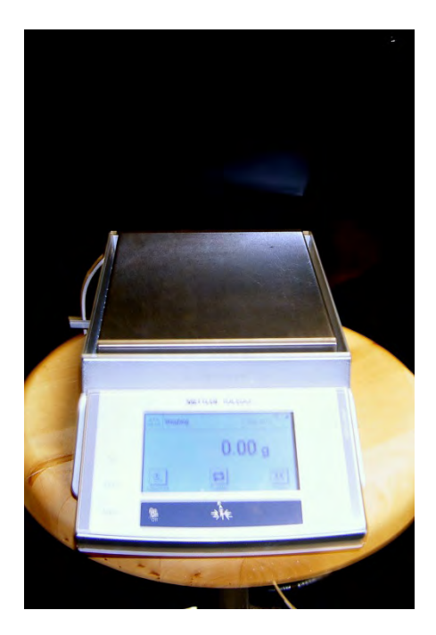
Figure 5: Top-loading weighing scale ('zero' scale before using)