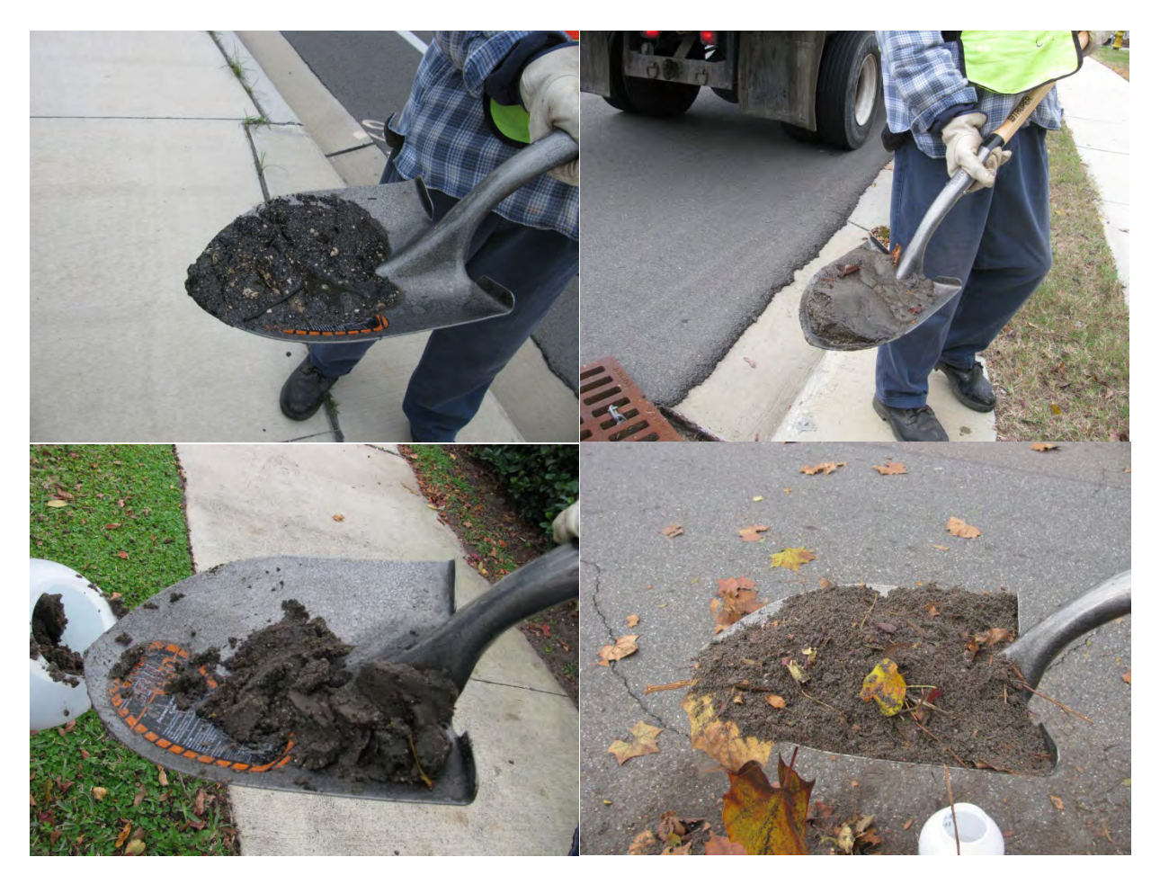
Figure 1: Visual indication of moisture content variability that can be observed in collected samples of solids that have been recovered during the MS4 study (can vary from dry to wet (top left)