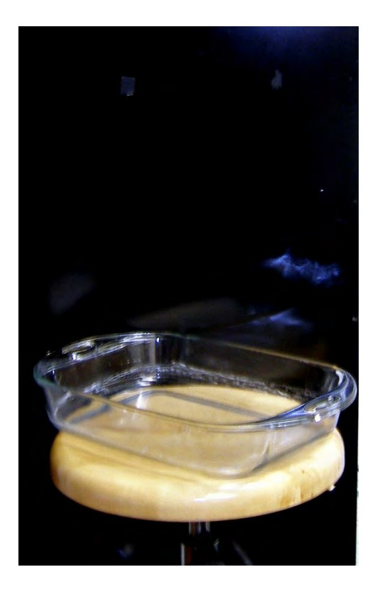
Figure 3: Pyrex baking dish for drying collected sample (clean and dry before pouring in sample)